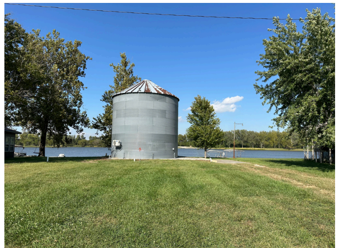
Setting the trend for how Real Estate is sold in the Midwest.

This information is thought to be accurate; however, it is subject to verification and no liability for error and omissions is assumed. Barnes Realty has made every effort to present accurate information on the property presented. Most of the information comes from outside sources: County/Government/Seller and human error can occur. It's the Buyer's responsibility to satisfy himself with the information presented and to determine the information to be true and accurate and the property to be suited for his intended use. The listing may be withdrawn with or without approval. The Seller further reserves the right to reject any and all offers. All inquiries, inspections, appointments, and offers must be sent through: