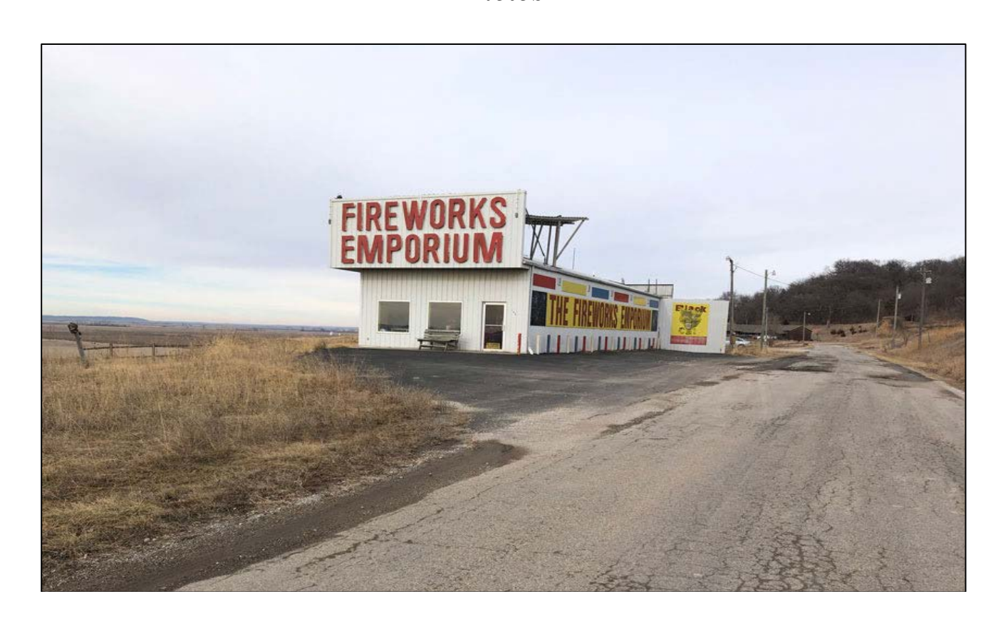
Poor Boys Fireworks