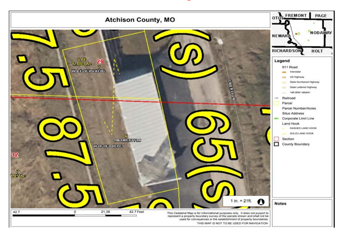
Tax Map Poor Boys Fireworks