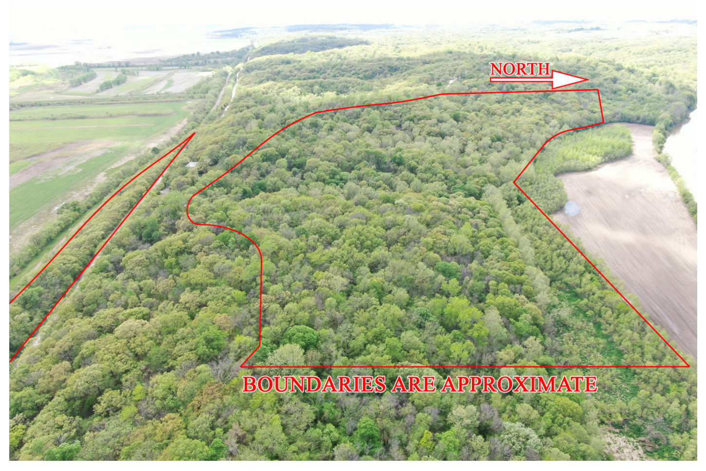
Setting the trend for how Real Estate is sold in the Midwest.

Head west from Amazonia on Hwy T for 4.6 miles. Turn left on road 400 and continue west for 1.4 miles and the tract is on the north and south side of the road