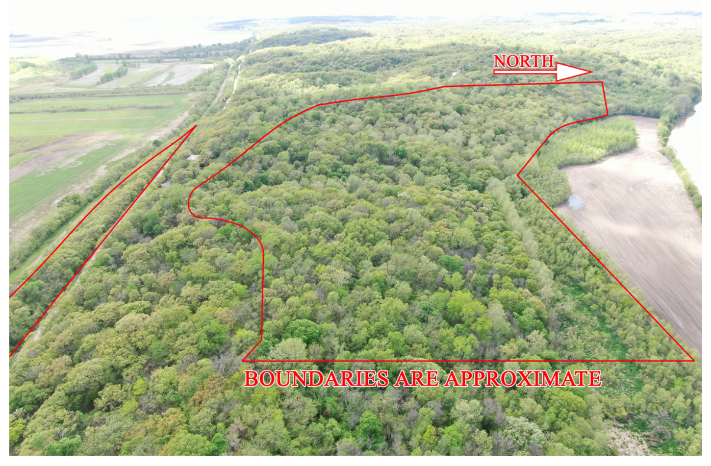
Setting the trend for how Real Estate is sold in the Midwest.

Head west from Amazonia on Hwy T for 4.6 miles. Turn left on road 400 and continue west for 1.4 miles and the tract is on the north and south side of the road